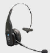
• 94ACC0127 Bluetooth Headset VX1 B350-XT